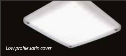
Low profile satin cover