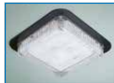
Bezel for semi-recessed mounting - black