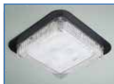
Bezel for semi-recessed mounting - black