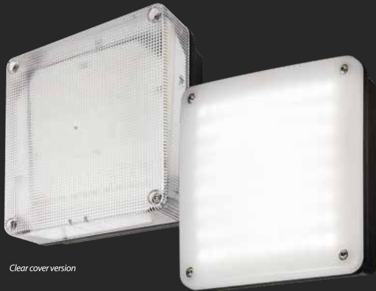
Clear cover version