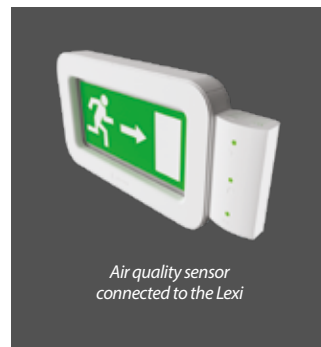
Air quality sensor connected to the Lexi