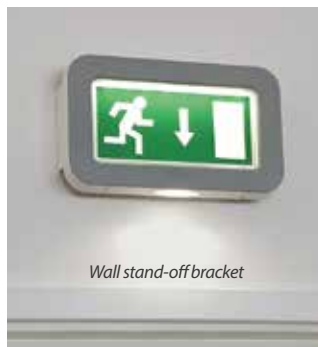
Wall stand-off bracket

End of life SmartScan batteries can be returned to Thorlux for recycling.