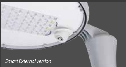
Smart External version