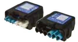
Connector 6-pole Live end (for connection to luminaire) - LCM 13219T Dead end (for connection from luminaire) - LCM 11820T