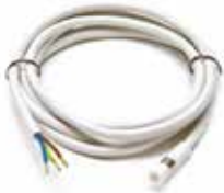
Connection lead 3-pole plug with 3-core cable stripped at one end 0.75mm 2 (for non factory fitted luminaires) 3m - LCM 14822