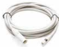
Hub extension lead 3-pole connectors with 3-core cable 1.5mm 2 3m - LCM 14823