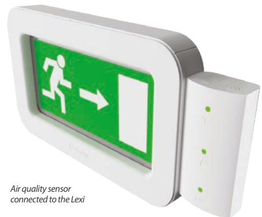
Air quality sensor connected to the Lexi