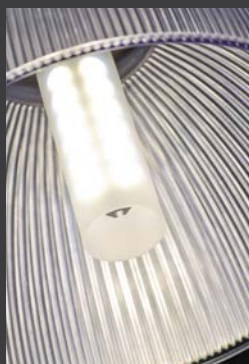
LEDs covered by satin tube to reduce glare and diffuse light