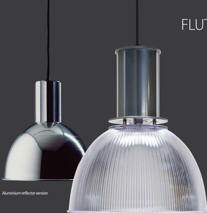
Aluminium reflector version