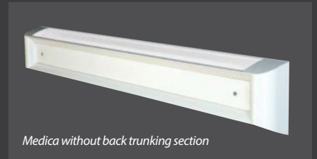
Medica without back trunking section