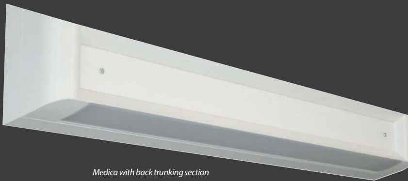
Medica with back trunking section