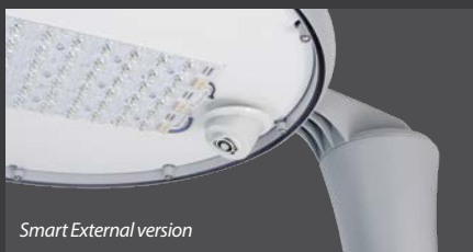
Smart External version