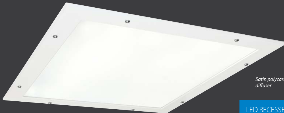
Satin polycarbonate diffuser