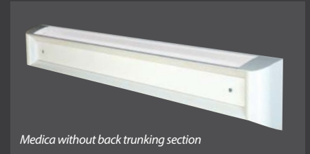
Medica without back trunking section