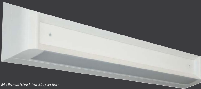
Medica with back trunking section