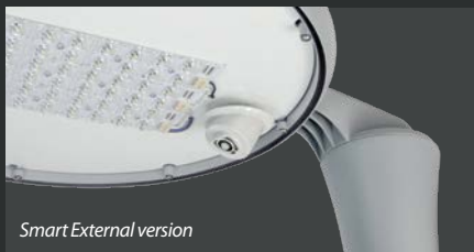
Smart External version